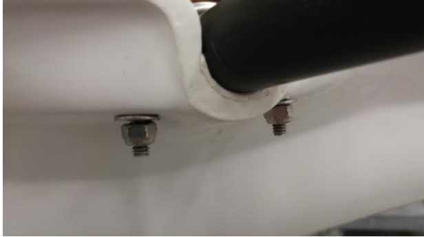
Peinert 26, X25 and Dolphin